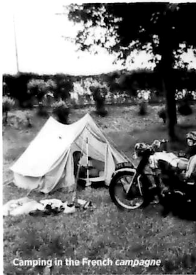
Camping in the French campagne