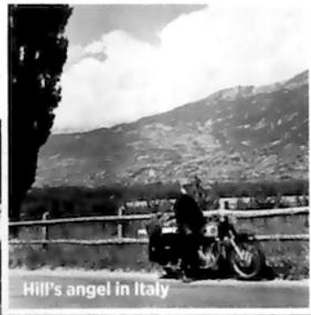
Hill's angel in Italy